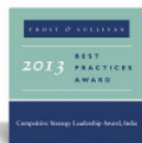
FROST & SULLIVAN Best Practices-2013