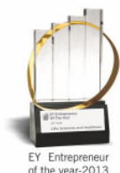
EY Entrepreneur of the year-2013